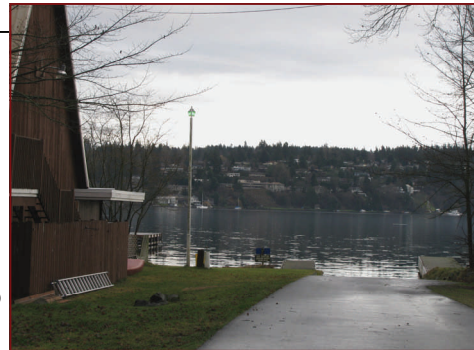
Lake Forest Park Civic Club overlooking Lake Washington