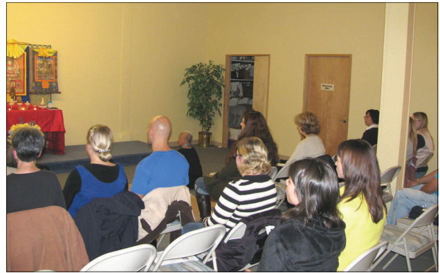
Top row: Avalokitesvara Puja, Oct 3, 2009 at East West Book Shop, Seattle, WA