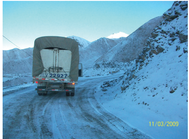
Pictures taken in Nov 2009 when delivery truck drove to school delivering dried food, clothing, shoes and socks. Pictures taken in Eastern Tibet, Kham.