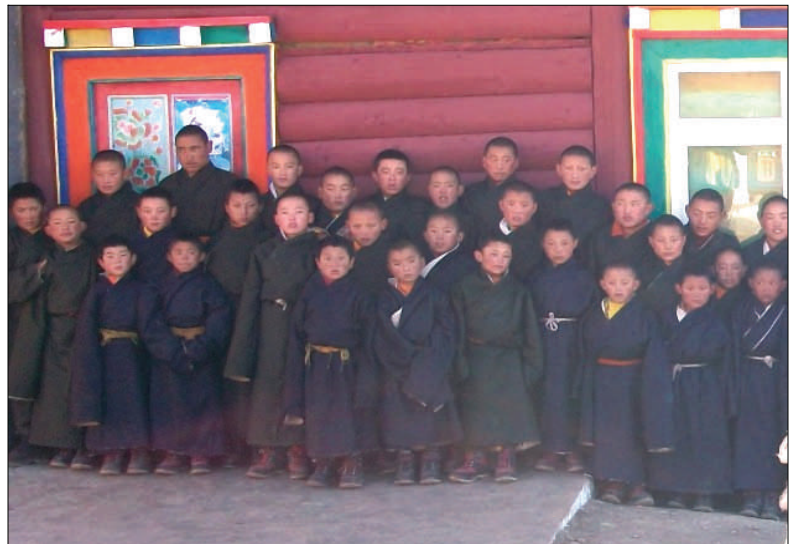
Top: Boys posing with their new coats, shoes and socks. Bottom: Chuba looks similar to “Harry Potter” outfit at a first glance

for all the children. We are thankful and continued to make progress in addition to providing warm clothing, shoes and socks to them finally.