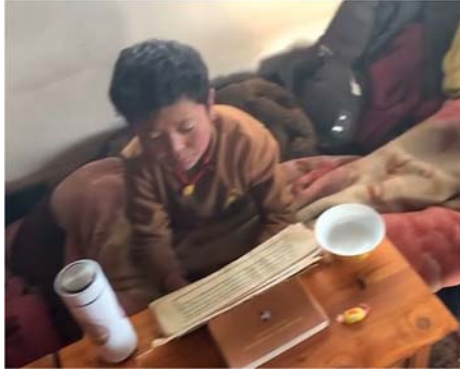
Photo (top) A student reading a traditional Tibetan textbook with loose pages.