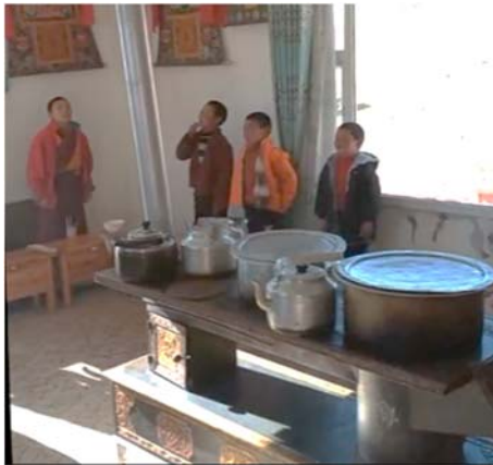
Photo (bottom) The stove sits in the center of the classroom and used for boiling water, cooking and keeping the space warm.

Sorry for the poor quality of the photos, which were sent to us via cell phone in June 2022.